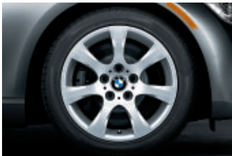
■ 17 x 8.0 Star Spoke (Style 185) light alloy wheels with 225/45R-17 run-flat 1 all-season tires. (std. on 335i)