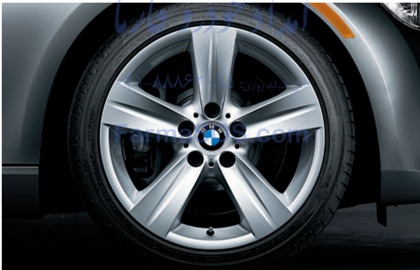
□ Star Spoke (Style 189) light alloy wheels and run-flat 1 performance tires. 2 In front: 18 x 8.0 wheels and 225/40R-18 tires; in back: 18 x 8.5 wheels and 255/35R-18 tires. (included in 335i Sport Package)