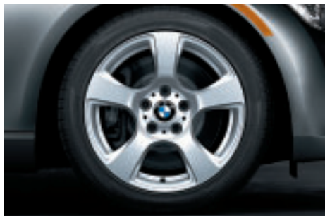
■ 17 x 8.0 Star Spoke (Style 157) light alloy wheels with 225/45R-17 run-flat 1 all-season tires. (std. on 328i)

■ Standard equipment □ Optional equipment