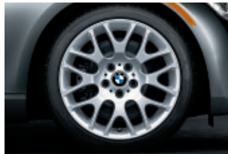
□ Cross Spoke (Style 197) light alloy wheels and run-flat 1 performance tires. 2 In front: 18 x 8.0 wheels and 225/40R-18 tires; in back: 18 x 8.5 wheels and 255/35R-18 tires. 3 (included in 328i Sport Package)