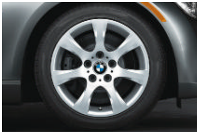
■ 17 x 8.0 Star Spoke (Style 185) light alloy wheels with 225/45 run-flat 1 all-season tires. (std. on 335i)