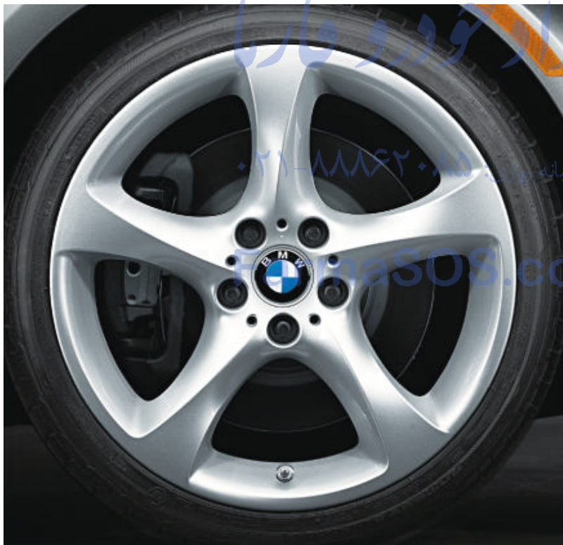
□ Star Spoke (Style 230) light alloy wheels and run-flat 1 performance tires. 2 In front: 19 x 8.0 wheels and 225/35 tires; in back: 19 x 9.0 wheels and 255/30 tires. (opt. on 335i, requires optional Sport Package)