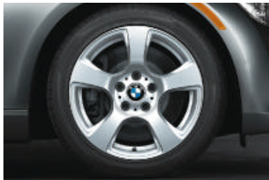
■ 17 x 8.0 Star Spoke (Style 157) light alloy wheels with 225/45 run-flat 1 all-season tires. (std. on 328i)