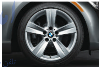
□ Star Spoke (Style 189) light alloy wheels and run-flat 1 performance tires. 2 In front: 18 x 8.0 wheels and 225/40 tires; in back: 18 x 8.5 wheels and 255/35 tires. (included in 335i Sport Package)