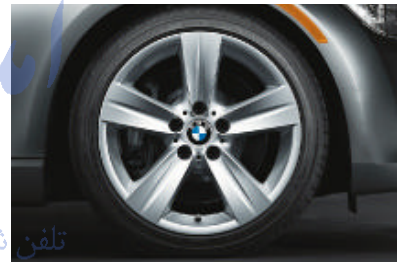
Star Spoke (Style 189) light alloy wheels and run-flat 2 performance tires. 3 In front: 18 x 8.0 wheels and 225/40 tires; in back: 18 x 8.5 wheels and 255/35 tires. (335i Sport Package)

Shown with Coral Red/Black Dakota Leather upholstery, Aluminum interior trim, and optional Navigation system.