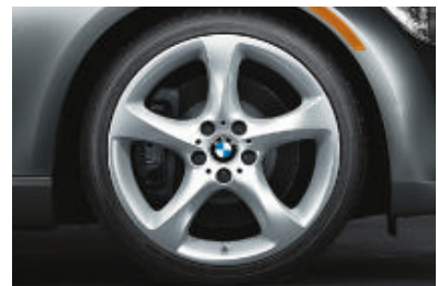
Star Spoke (Style 230) light alloy wheels and run-flat 2 performance tires. 3 In front: 19 x 8.0 wheels and 225/35 tires; in back: 19 x 9.0 wheels and 255/30 tires. (opt. on 335i, requires opt. Sport Package)