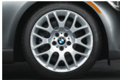
□ Cross Spoke (Style 197) light alloy wheels and run-flat 1 performance tires. 2 In front: 18 x 8.0 wheels and 225/40 tires; in back: 18 x 8.5 wheels and 255/35 tires. (included in 328i Sport Package)