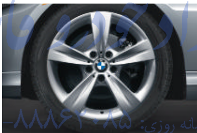
□ Star Spoke (Style 287) light alloy wheels and run-flat¹ performance tires. 2 In front: 18 x 8.0 wheels and 225/40 tires; in back: 18 x 8.5 wheels and 255/35 tires. (included in 335i Sport Package; opt. in 335i xDrive, requires opt. Sport Package)