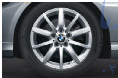
□ Star Spoke (Style 286) light alloy wheels and run-flat¹ performance tires. 2 In front: 17 x 8.0 wheels and 225/45 tires; in back: 17 x 8.5 wheels and 255/40 tires. (included in 328i Sport Package; opt. in 328i xDrive, requires opt. Sport Package)