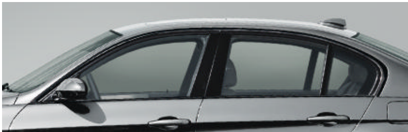
High-Gloss shadowline trim gives a purposeful look to window frames, window recess finishers, and door-sill trim strips.

The Sport Package injects even greater excitement into every minute spent behind the three-spoke, leather-wrapped multi-function sport steering wheel. 1 Larger wheels 2 and run-flat performance tires 3 team up with the sport-tuned suspension 4 to grip corners with a vengeance. Specially bolstered sport seats cradle you comfortably over long distances, while holding you firmly in place during sporty driving maneuvers.