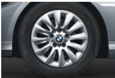
■ 16 x 7.0 Multi Spoke (Style 282) light alloy wheels with 205/55 run-flat¹ all-season tires. (std. on 328i/328i xDrive )