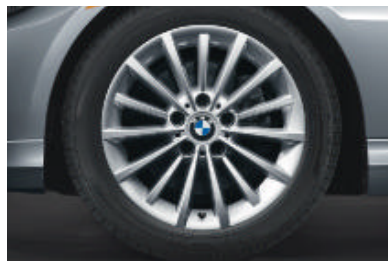
■/□ 17 x 8.0 Multi Spoke (Style 284) light alloy wheels with 225/45 run-flat¹ all-season tires. (std. on 335i, 335i xDrive and 335d; included in 328i xDrive Sport Package)