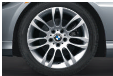
□ Double Spoke (Style 195) light alloy wheels and run-flat¹ performance tires. 2 In front: 18 x 8.0 wheels and 225/40 tires; in back: 18 x 8.5 wheels and 255/35 tires. (included in 335d Sport Package)