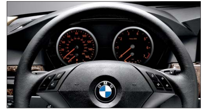
Primary gauges are recessed under a cowl, and designed for glare-free vision during the day. At night, the gauges glow in a color that is restful on the eyes.