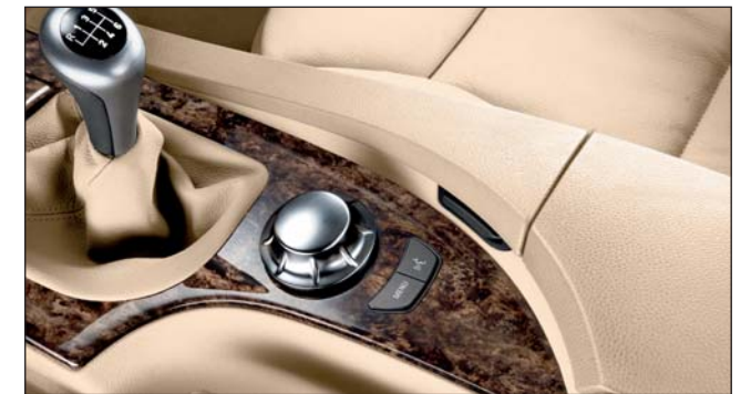
The iDrive Controller, which is conveniently located on the center console, allows you and your passenger to access and tailor many comfort features.

An interior as sleek and compelling as the exterior.