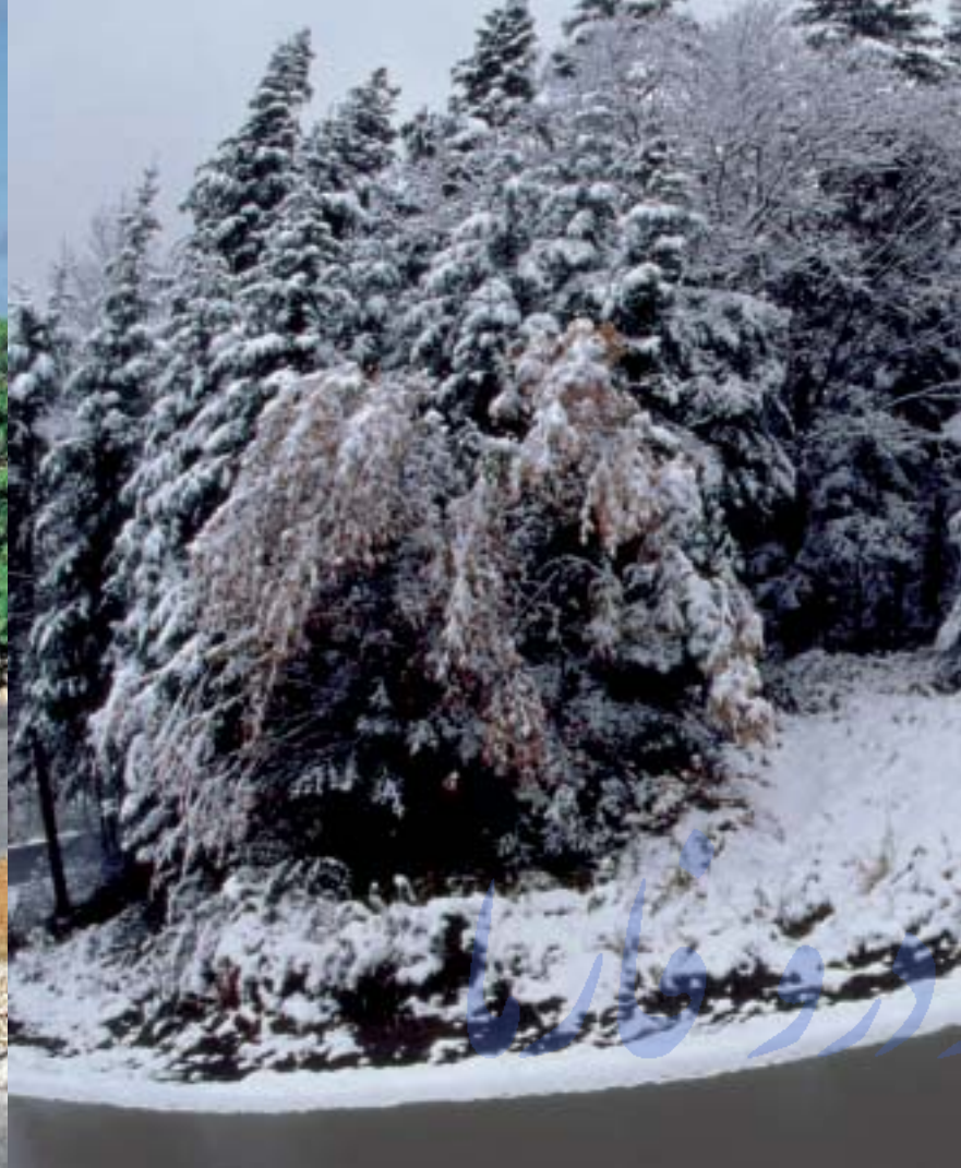
xDrive detects snow under the rear tires. For optimal traction, the clutch plate transfers more power to the front wheels.