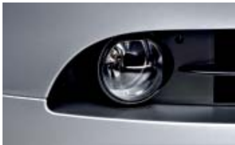
Illustration shown with European bumper. All U.S. 5 Series Sedans are equipped with provisions on the front bumpers for headlight washers, which are included in the optional Cold Weather Package.

■ Halogen free-form foglights , integrated into the deep front spoiler, enhance your margin of safety in bad visibility. Ellipsoid free-form technology ensures even light distribution on the road.