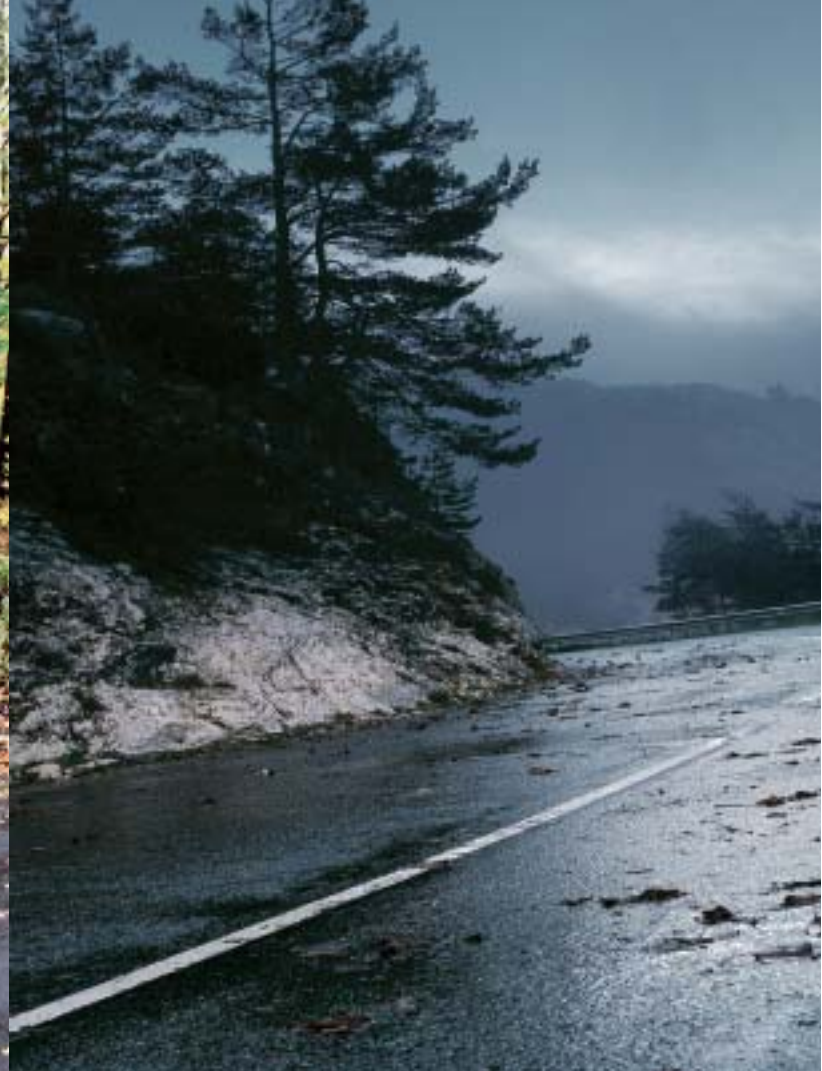
The road is covered in water. As all the wheels reach the wet asphalt, xDrive, sensing wheelspin, sends sufficient traction to appropriate wheels to help maintain stability.