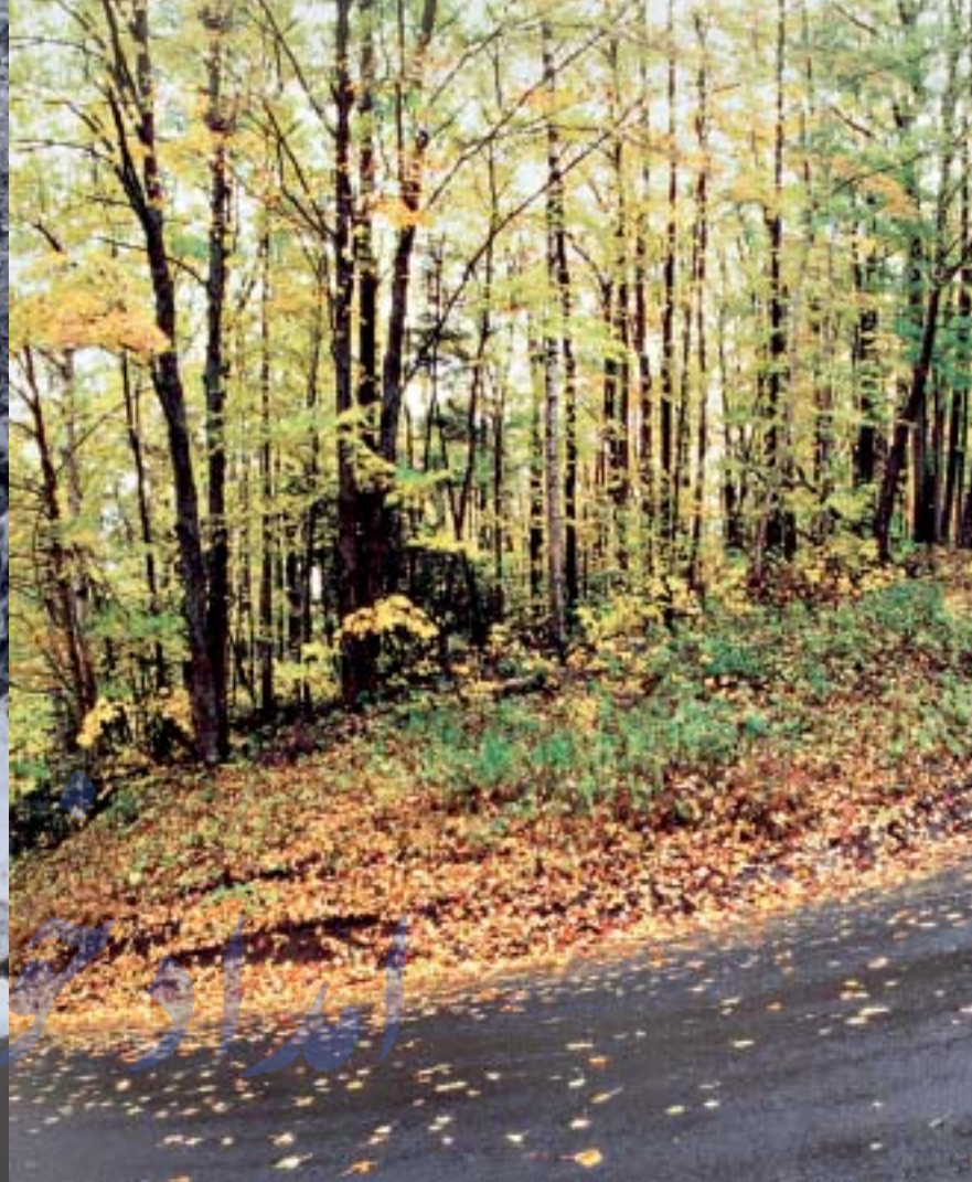
The front tires drive over slippery leaves. In split seconds, the clutch plate opens, sending all available power to the rear axle.